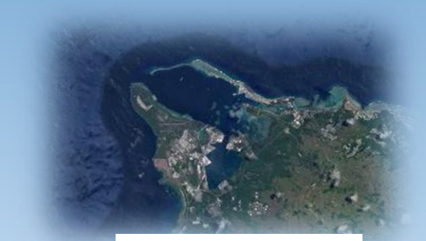
Navy Base Guam